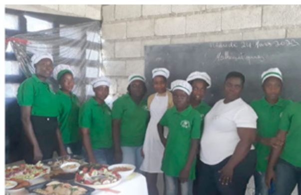
Lott Carey Professional School de Miragoâne