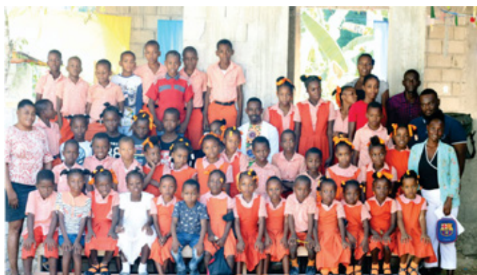
Institution Chrétienne Lott Carey de Fonds des Nègres