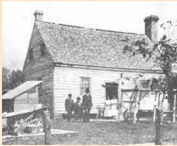
Photo of the Lott Cary house taken during a 1924 visit by a group of Richmond ministers.

The first fifth Sunday each year is the celebration of the Annual Lott Carey Richmond Rally. For 35 years, churches from Richmond and the greater Richmond area – Henrico, Chesterfield, Goochland, Hanover, King William, Powhatan, and other places – join together in worship and witness to the Word of God and for the benefit of Lott Carey.