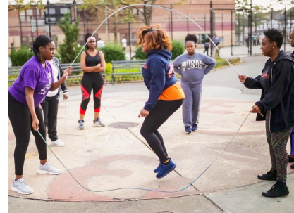
The inaugural Jumping 4 Justice Double Dutch Revival Community Outdoor Event will be held on Saturday, May 14 at Fountain Baptist Church in Summit, NJ. Come get your jump on!