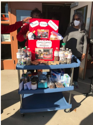
Tidewater’s Nickels for Nigeria Coin Project

Mt. Zion Missionary Baptist Church Ringgold, VA