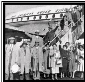
Lott Carey Mission Trip