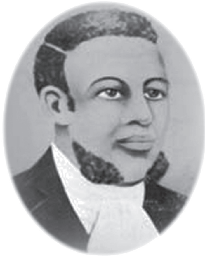
Rev. Lott Carey 1780 – 1828