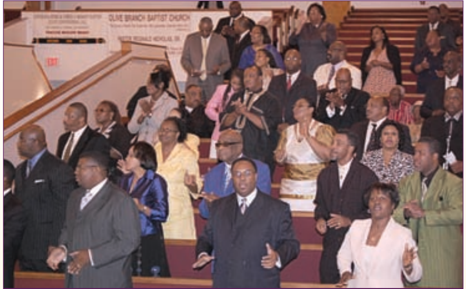
Fountain Project pastoral consultation participants and others worship together during a service and grant awarding program.

The pastoral consultation began in May 2007 and brought together a core group of about 30 ministers for more than a year to support and care for each other and to focus on worship, nurture and mission via workshops, retreats and other activities.