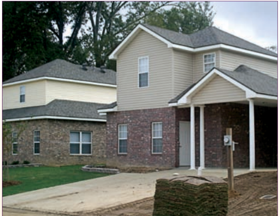
New homes like this one in Lake Charles, La., are planned for the area's needy.

One of the integral components of the restoration center's work is its employment readiness program. Clients learn such things as how to complete a job application, the proper communication during a job interview and cultural